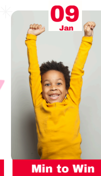
Min to Win